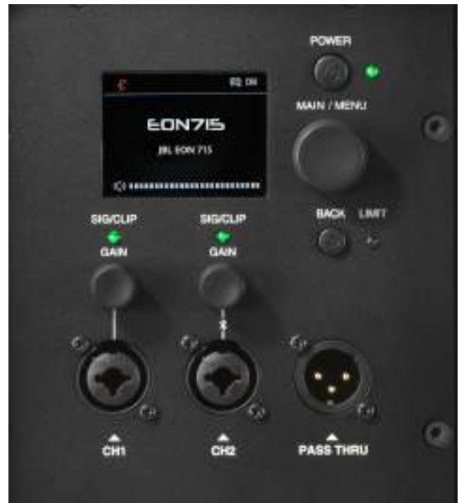
REAR PANEL CONNECTIONS

The JBL EON715 15-inch loudspeaker, part of JBL's new EON700 Series of powered PAs, brings advanced DSP and control to portable systems for live sound and installed applications, with class-leading volume and clarity and comprehensive features that make setup and operation a breeze.